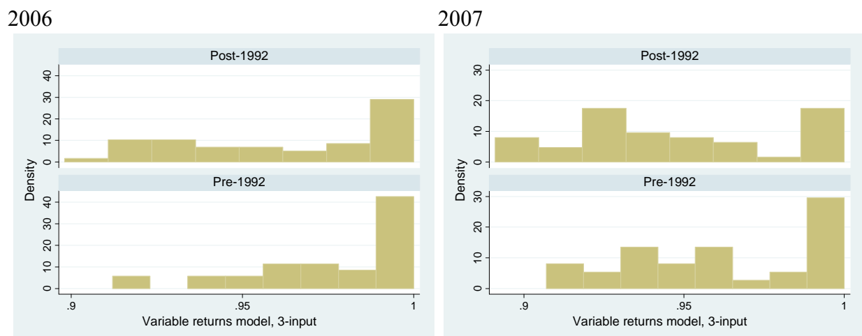
Figure 2: Histograms of VRS three-input efficiency relative to full sample.

Figure 2 shows the histograms for VRS technical efficiency using the three-input all-universities model, dividing the sample into pre-1992 and post-1992 universities. From this figure it can be seen that, not only are the average levels of efficiency similar between the two groups of universities, there is also significant overlap in efficiency. Therefore, it is not possible to identify the type of university simply from the efficiency of its students.