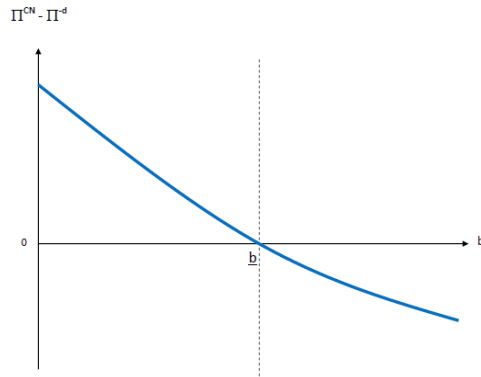
Figure 1: The cheated firm's incentive to punish deviation, \Pi^{CN} - \Pi^{-d} .