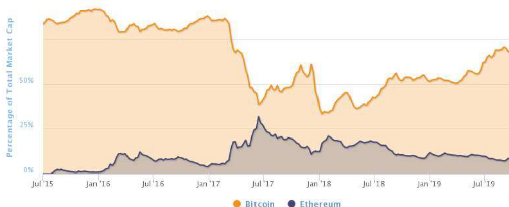
Figure 1. Comparison of Bitcoin and Ethereum market share over Ethereum's lifetime.

The ever-growing popularity of cryptocurrencies, promoted by Bitcoin, stimulated the growth of financial literature that study digital currencies, their application and effect on financial markets. Since Bitcoin is the first cryptocurrency and the recognized market leader, it became a focus of attention of the most research papers. Correspondingly, in recent literature little attention is paid to alternative cryptocurrencies. The second most popular digital currency – the ethereum/ether was introduced in 2015. Ether is a token or cryptocurrency based on the ethereum platform. Together with Bitcoin they dominate the cryptocurrency universe and account for almost 70% of combined market share (Figure 1). Similar to Bitcoin, Ether experienced rapid growth in price from a few cents per Ether after its introduction in 2015 reaching maximum of $1,432.88 on January 13, 2018 2 .